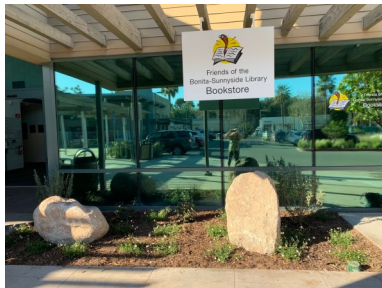
Hope you can come visit us SOON!!

FOL website: https://bonitasunnysidefol.org FOLFacebook page: https://www.facebook.com/ BonitaSunnysideFriendsoftheLibrary